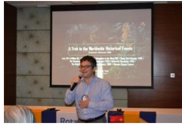
Filippo introducing guests and visitors