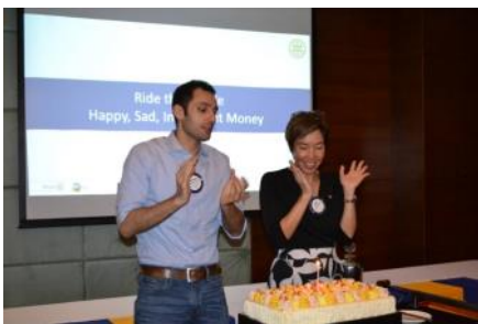
September birthday cake